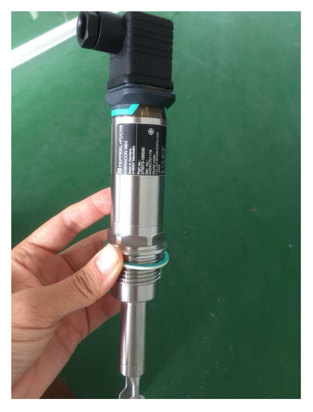
New level sensor PEPPERL + FUCHS brand, originally made in Germany