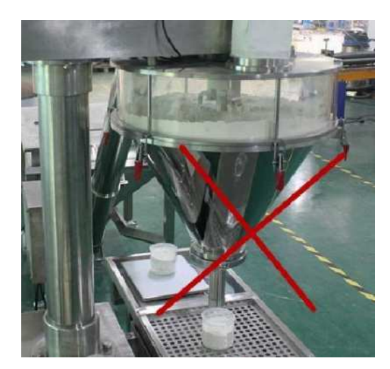
Disconnect hopper it is not easy to take hopper apart and do cleaning.