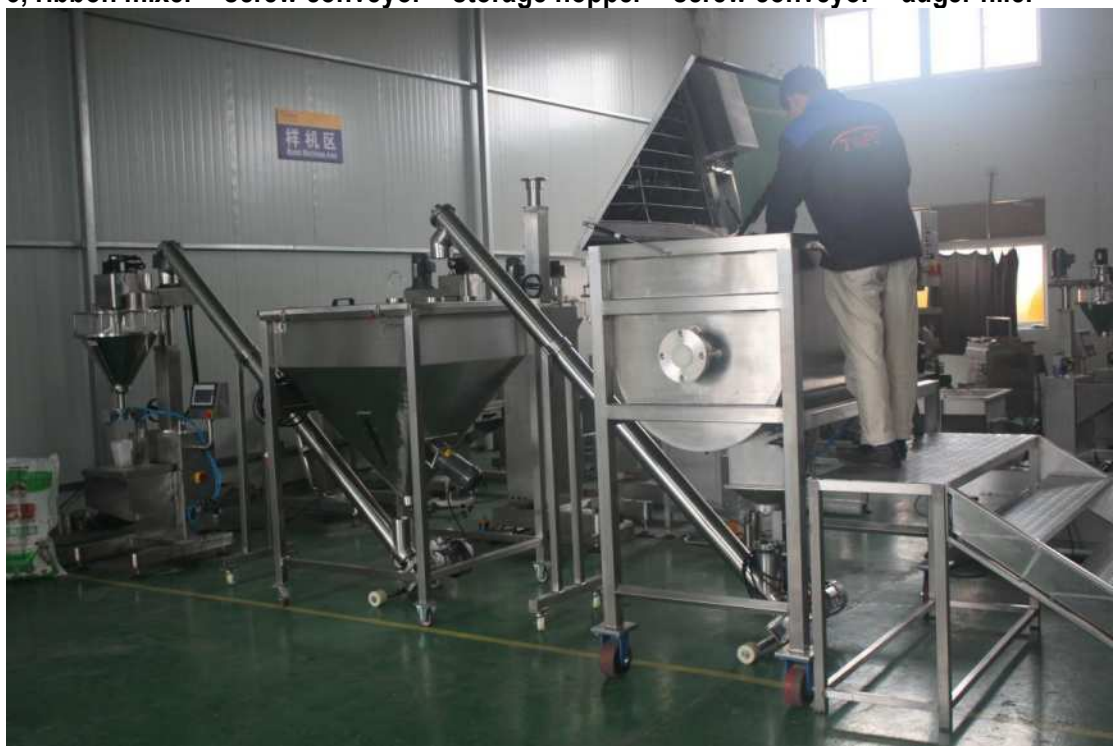
4,screw feeder + ribbon mixer + screw feeder + auger filler

3, ribbon mixer + screw conveyor + storage hopper + screw conveyor + auger filler