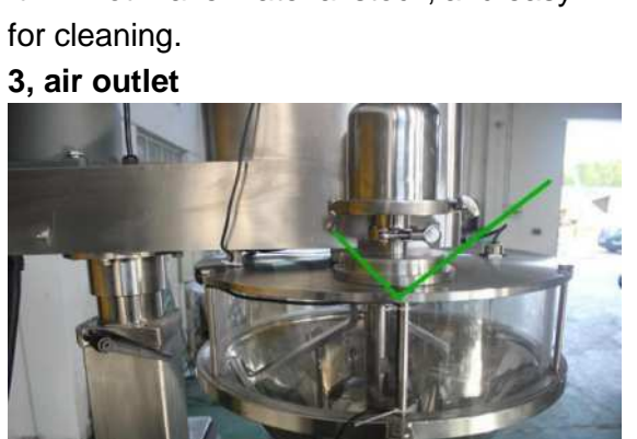
Stainless steel type

It will not make material stock, and easy