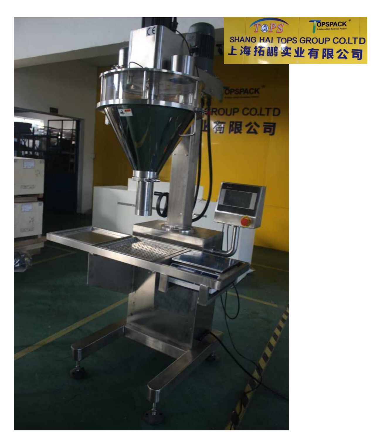
High quality packing machines manufacturer welcome to visit us!