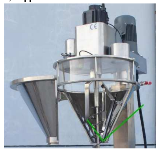
Level split hopper It is very easy to open hopper and do cleaning.