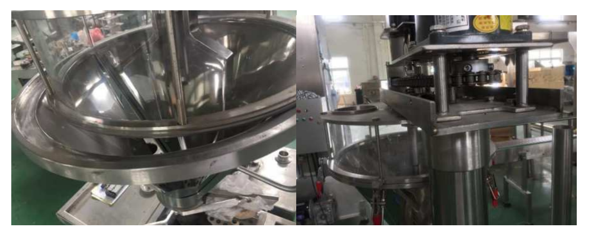
Hopper opening & closing