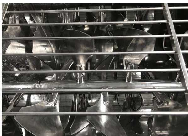
The mixing paddle