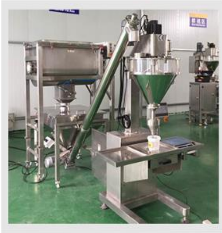
1 work with auger filler