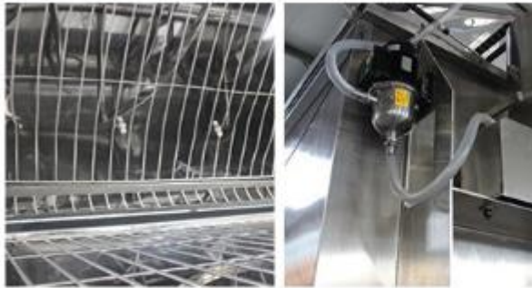
option: spray system

The top cover of the U Shape tank has the entrance for material. It can be also designed with spray or add liquid device according the customer's needs.