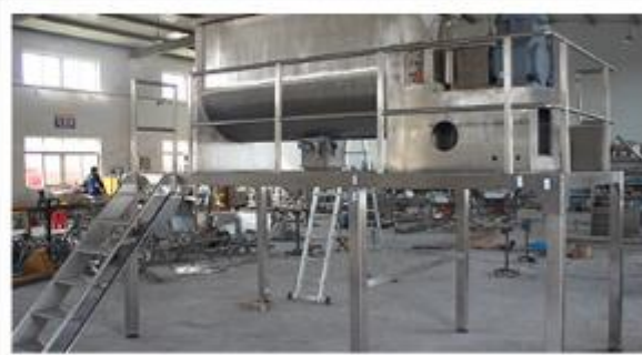
option: working platform and stair