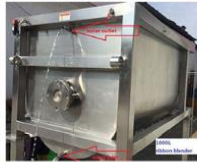
option: jacket for colding or heating

The top cover of the U Shape tank has the entrance for material. It can be also designed with spray or add liquid device according the customer's needs.