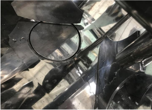
The discharge port from the inside of the mixer