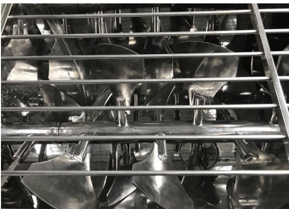
The mixing paddle